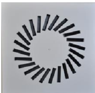
DSD-CA-500x24 DSD-CA-600x24 DSD-CA-625x24